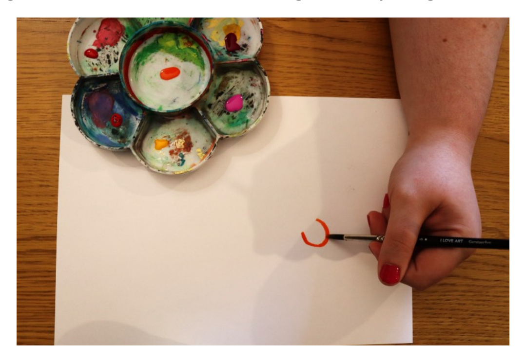
Using 3-6 colours total think about the different elements for the page, one colour at a time will make it slightly easier to plan how the image will turn out

First of all think what it is you want to create - it could be Autumn inspired or it could be something completely unrelated, whatever imagery you want to create try something that will work well with just lines - something bold! We can't use pencil for this one as it would show through the ink - sometimes it is good to just go for it!