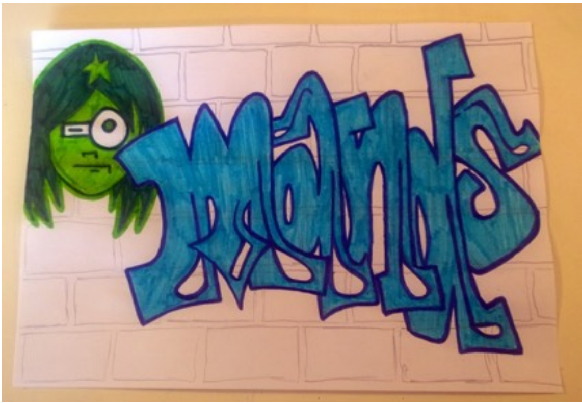
And there you have your very own "Graffiti Wall"